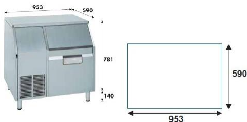
Stainless steel AISI 304